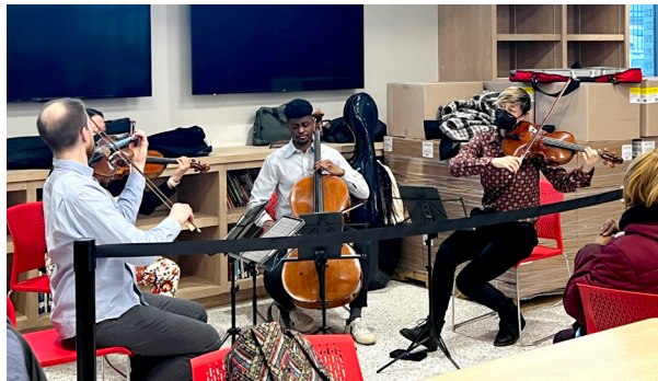
Thalea String Quartet

A special thank you to Thalea String Quartet with Tulsa Chamber of Music and to the Tulsa Symphony for visiting Iron Gate to play for our guests during our community meal hours.