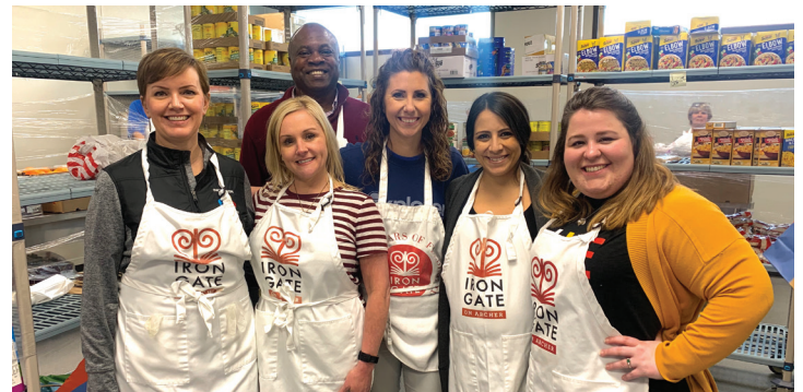
Explorer Pipeline employees volunteered for Iron Gate's grocery pantry in January, helping 58 families with groceries.