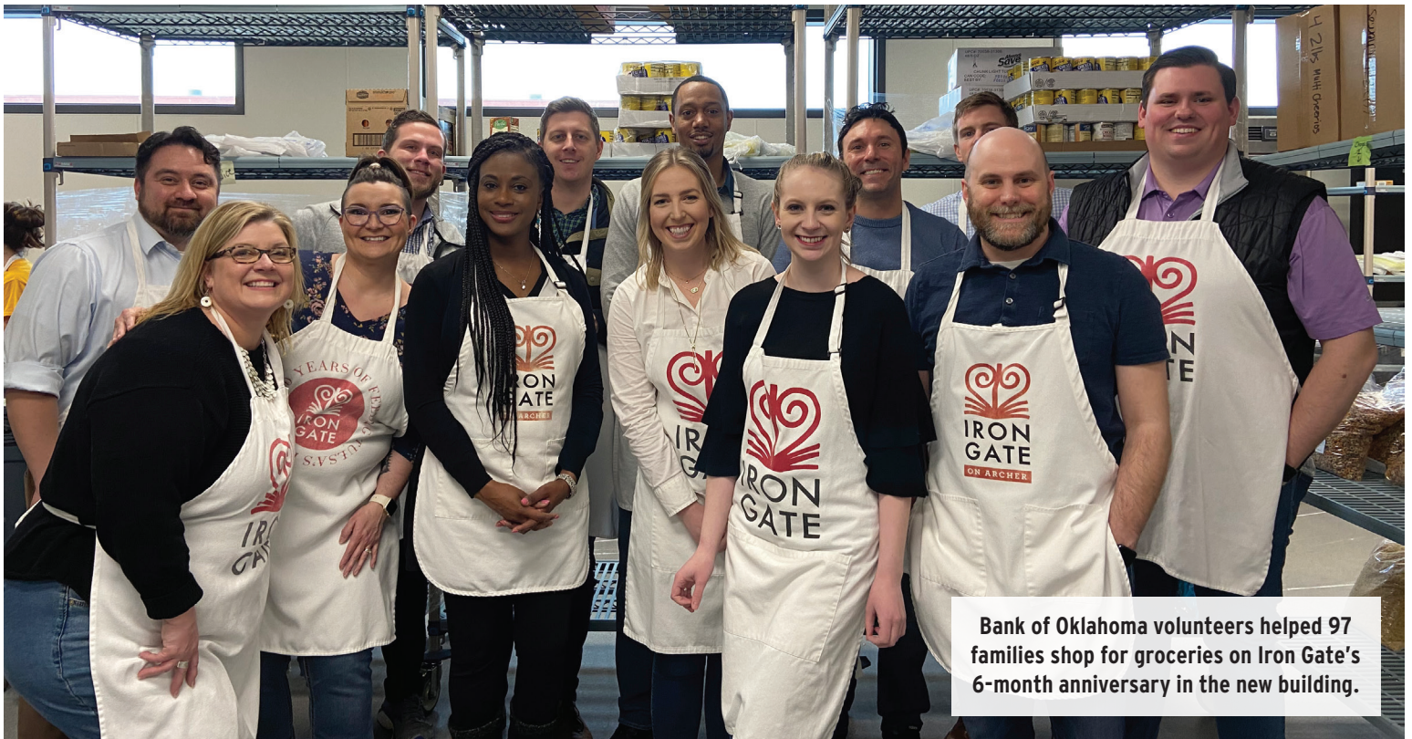
Bank of Oklahoma volunteers helped 97 families shop for groceries on Iron Gate's 6-month anniversary in the new building.